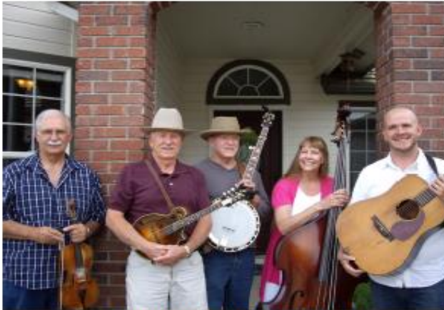
Featuring Hickory Bluff and