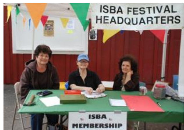
Ready For Another Year