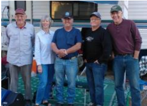
Ladd Canyon Ramblers