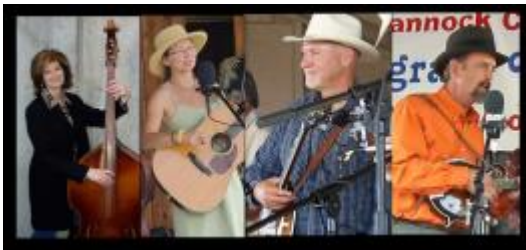
New South Fork