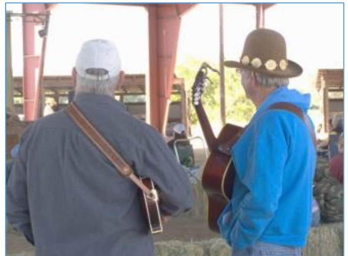
That Was A Mighty Good Time