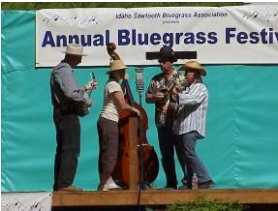
Montana Coalition