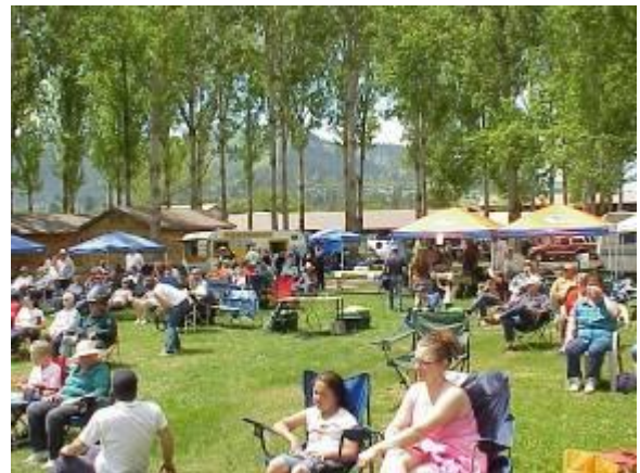
Enjoying the Music and the Weather

If you enjoy easy listening that touches your soul, better check it out.