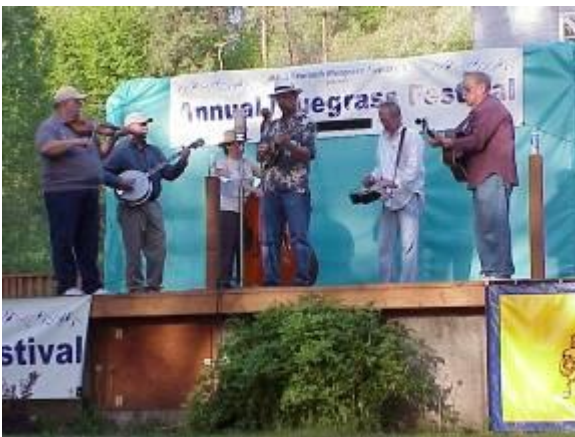
Tradition Bluegrass Band