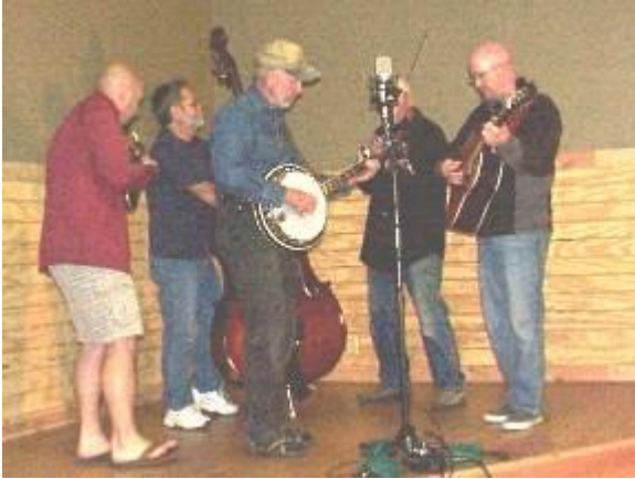
Chicken Dinner Road at Open Mic