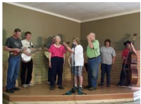
More Gospel Music