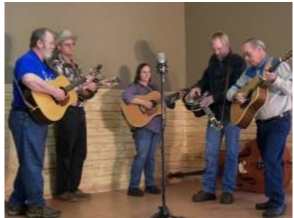
Some fine music from the Gospel Set