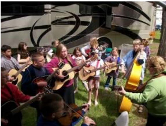
Kids In Bluegrass practicing away