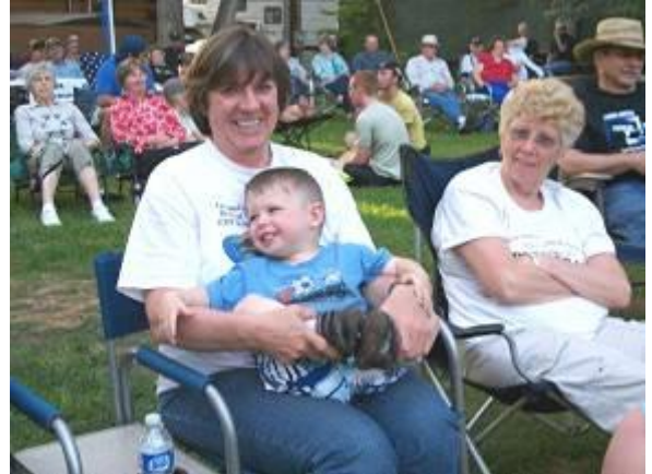
All Ages Love Bluegrass