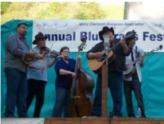
Downstate Ramblers