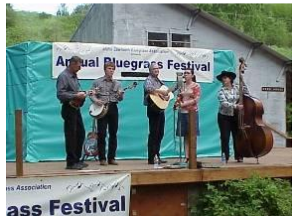
Higher Ground