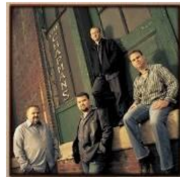
Album Cover from “Simple Man”