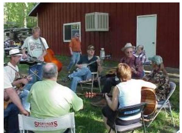
Just a pickin' and a grinnin'