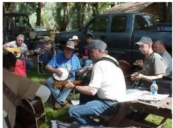
The thing we like best, pickin'