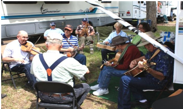
Jamming at Kamiah 2014

Come join us Labor Day weekend and end your summer on a Bluegrass note!