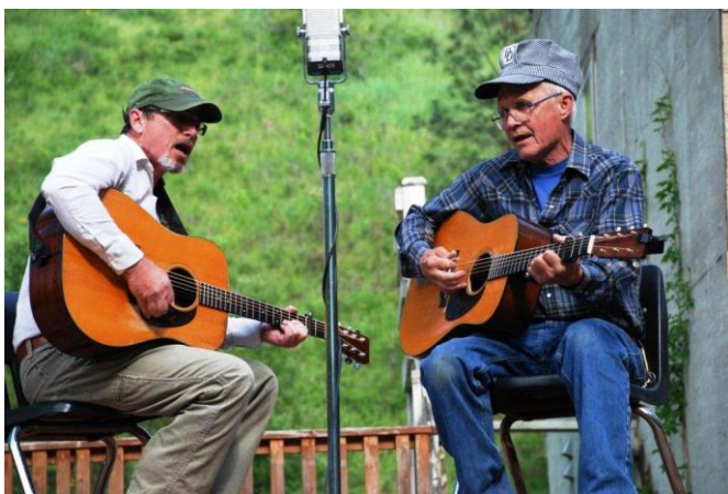
Gravelly Mtn Boys Kamiah 2014