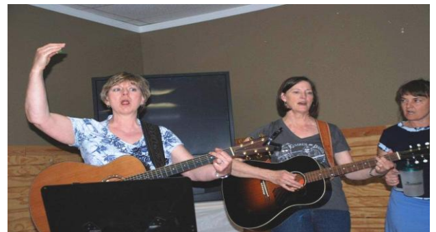
Harmony Workshop Kamiah 2014