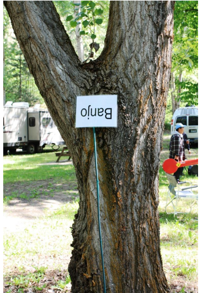
Banjo Workshop Sign Kamiah 2014