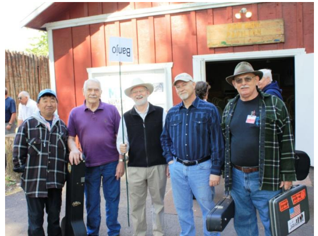
Banjo Workshop Instructors + 1 Kamiah 2014