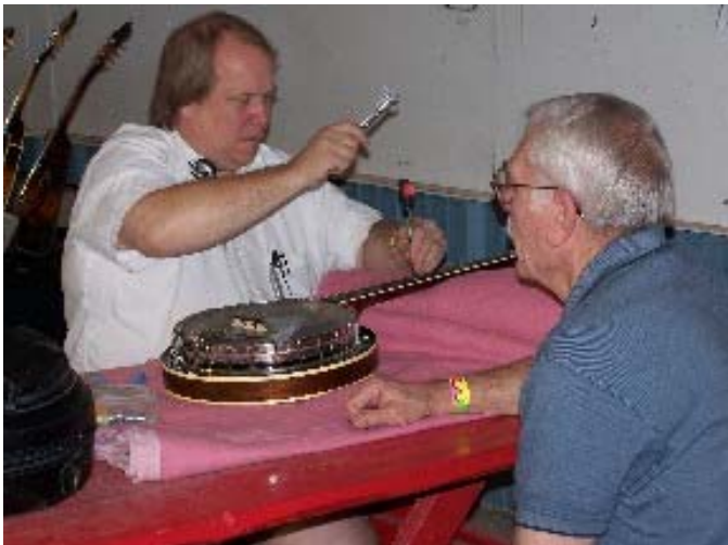
A little Instrument Repair