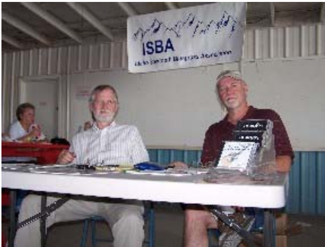
Workin' hard at the ISBA Booth